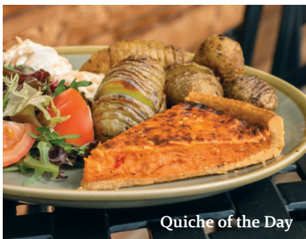
Quiche of the Day