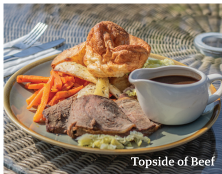
Topside of Beef