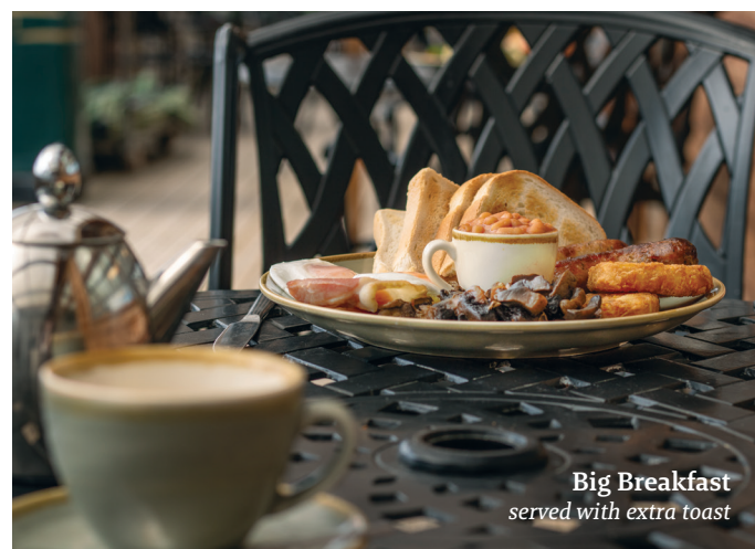
Big Breakfast served with extra toast