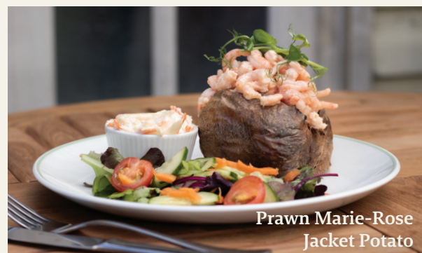
Prawn Marie-Rose Jacket Potato