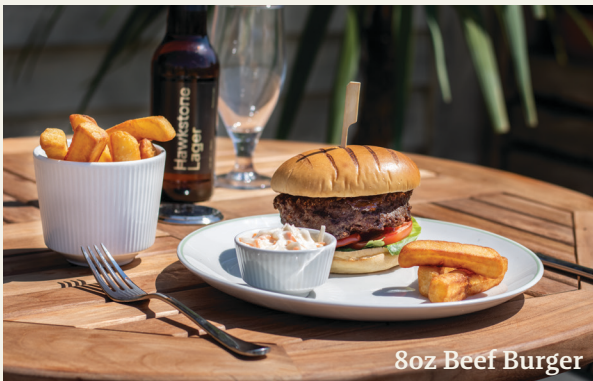
8oz Beef Burger