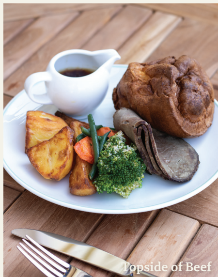
Topside of Beef