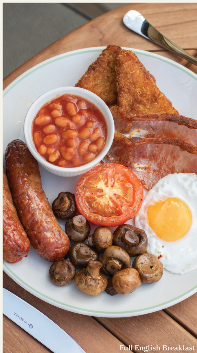
Full English Breakfast