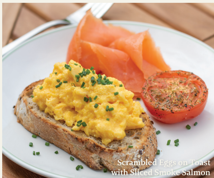
Scrambled Eggs on Toast with Sliced Smoke Salmon