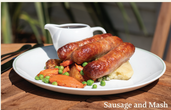
Sausage and Mash