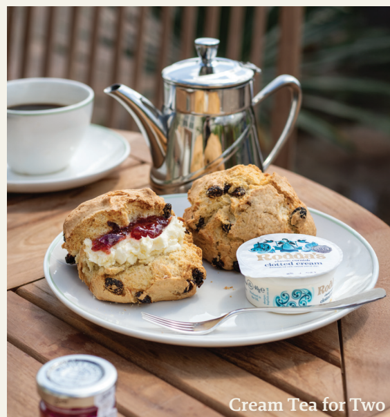
Cream Tea for Two