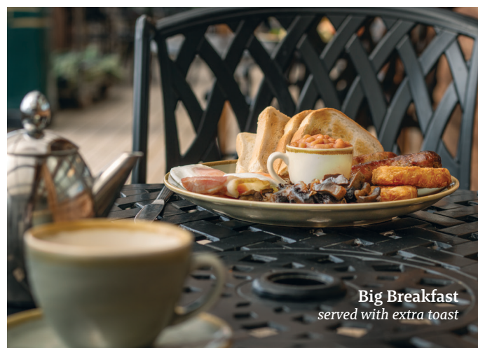
Big Breakfast served with extra toast